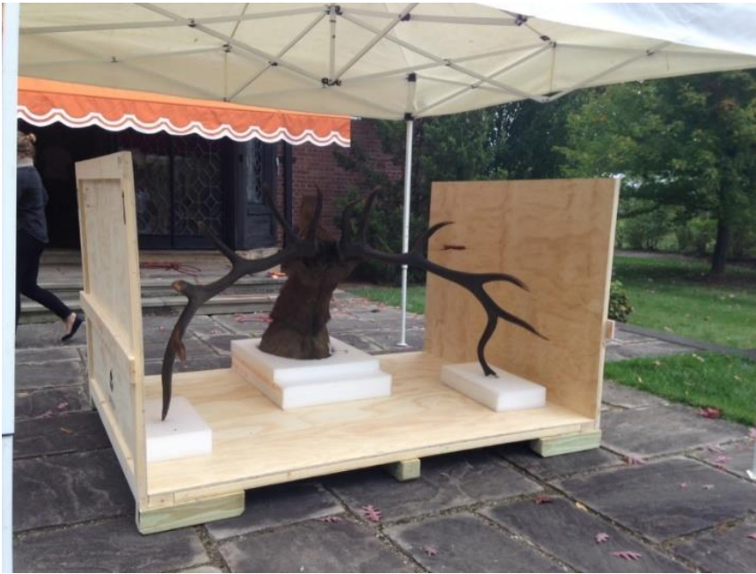
Photo Gallery of the Restoration Process of the American Elk Head