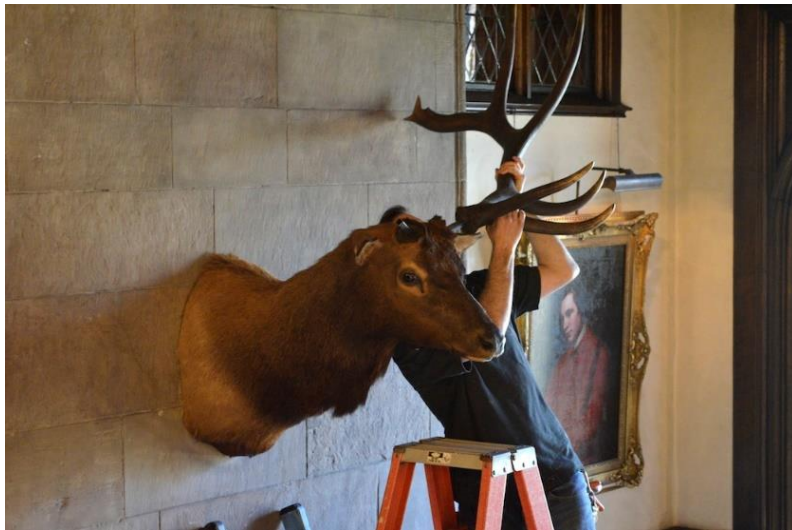
The Elk is reinstalled on the Great Hall mantle in the Manor House. the antlers are now removable, so cleaning and care is easier.