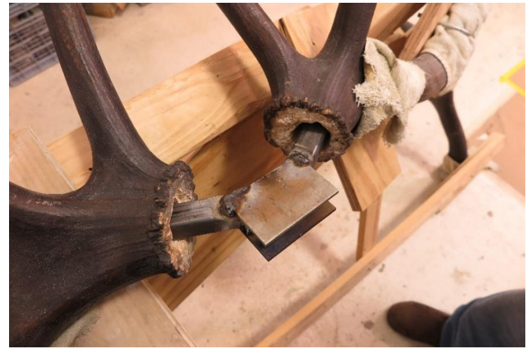
The antlers were given steel supports so they wouldn't droop anymore.