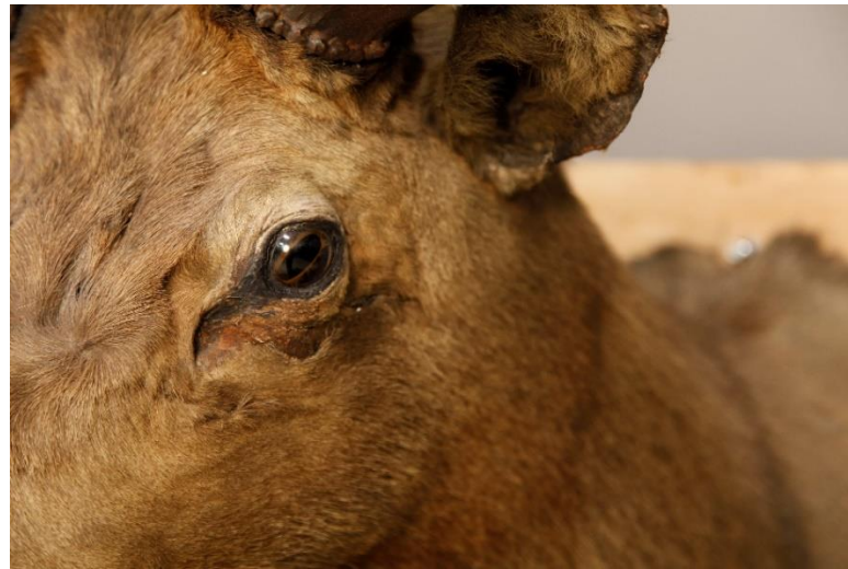
The elk's face before restoration had dents and cracks that needed to be fixed.