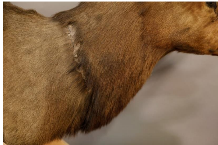
The mount was heavily photographed before restoration began.