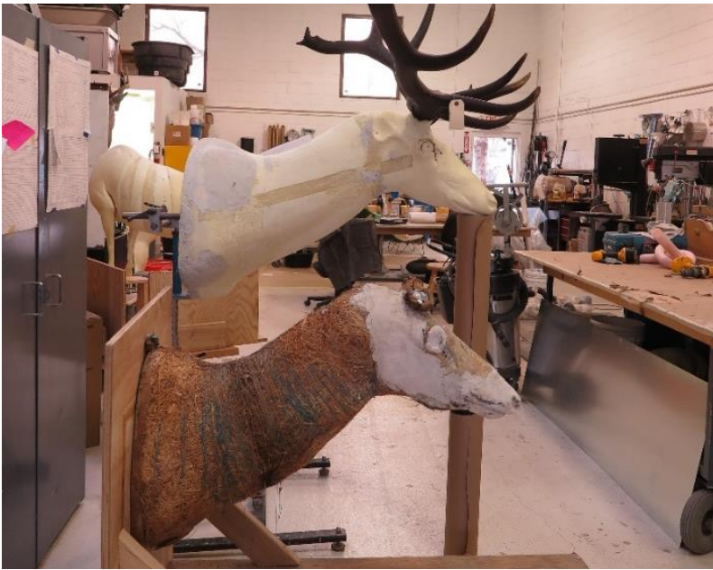
The old mount is on the bottom, the new one is on